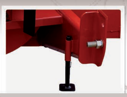
Parking stand, useful for storage, standard on all Blizzard snowblowers.