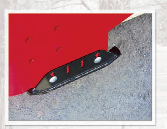
ADJUSTABLE SKID SHOES