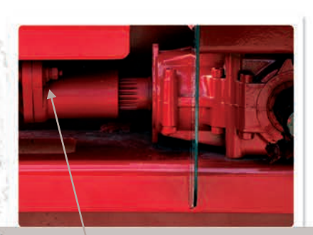
Shear bolt protection on the drive shaft to prevent costly repairs.

Quality is not an option: when we build our snowblowers we always use the best components on the market to ensure longer life and reliability of all our products.