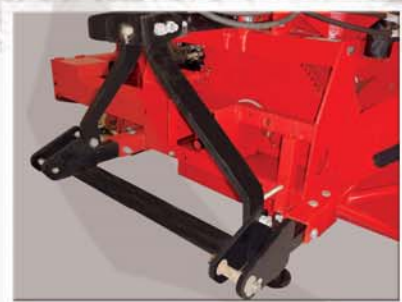
NEW 3 POINTS HITCH ARMS