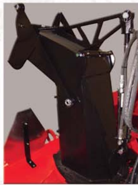
NEW RE-DESIGNED CHUTE