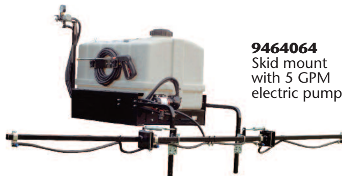
9464064 Skid mount with 5 GPM electric pump