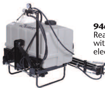
9464085 Rear mount with 5 GPM electric pump