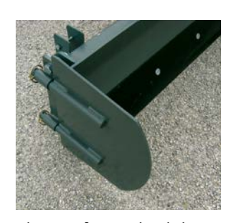
Close-up of optional end plate - sold in pairs.

The patented SSGB-8A Grader is designed to be used by asphalt, landscaping, and concrete flatwork contractors. The unit has a 8-foot, six-way hydraulically controlled moldboard operated by an in-cab remote. With an optional laser system, the grader will maintain grade to tight tolerances. To help prevent damage, the moldboard is shear pin protected. Unit comes complete with 1/2" "connect under pressure" flat-faced hydraulic couplers and a reversible beveled cutting edge for long life. Optional End Plate Kit (Pair, #811980) and Laser Pole Kit (Pair, #812110) available.