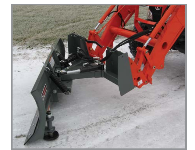
Adjustable skid shoes are standard