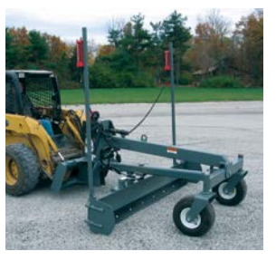
Optional laser pole kit - sold in pairs.