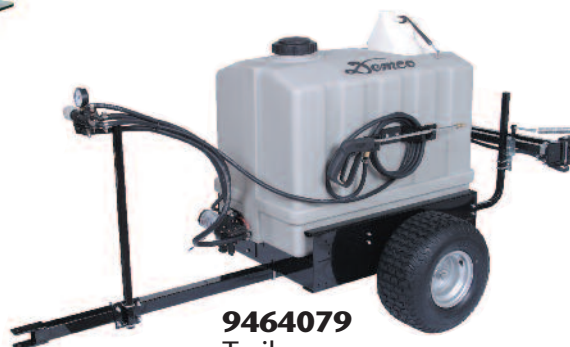
9464079 Trailer with 5 GPM electric pump