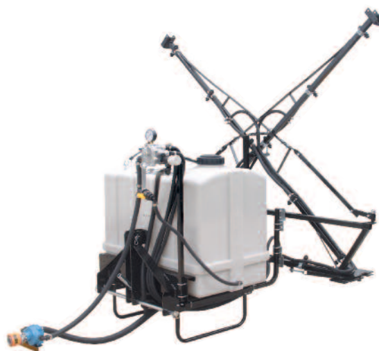
9464090 Rear mount with PTO pump