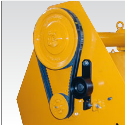
Adjustable belt tension.