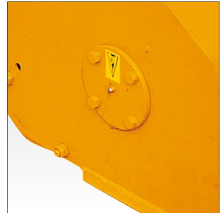
Rotor with internal sealed bearings