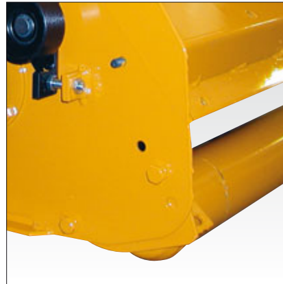
Rear adjustable roller