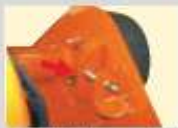
Belts tightener with screw for belts tensioning.