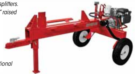
Hydraulic log lifter is optional

*Rated tonnage comparable to 16 ton rated standard log splitters. Options include log lifter, heavy duty suspension, 4" or 8" raised bed height, 24" nose extension, swivel jack, pintle hitch.