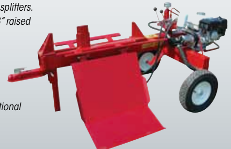
Hydraulic log lifter is optional

*Rated tonnage comparable to 16 ton rated standard log splitters. Options include log lifter, heavy duty suspension, 4" or 8" raised bed height, 24" nose extension, swivel jack, pintle hitch.