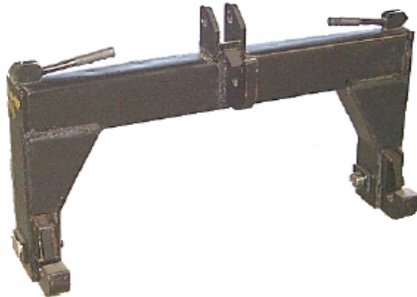
Cat. 2 Quick Hitch

Worksaver Quick Hitches are built for fast, safe, and easy connection (or disconnect) of 3-point implements. It will give you years of trouble-free service in handling your equipment because it is constructed of heavy steel bar and tubing. The Worksaver Quick Hitches fit most Category III 3-point hitch tractors. Completely assembled, ready to mount to your tractor.