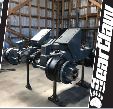
North American axles / Highway truck brakes: Makes spare wheels and axle/brake parts easier to find. Removable stub axles for any major repairs.