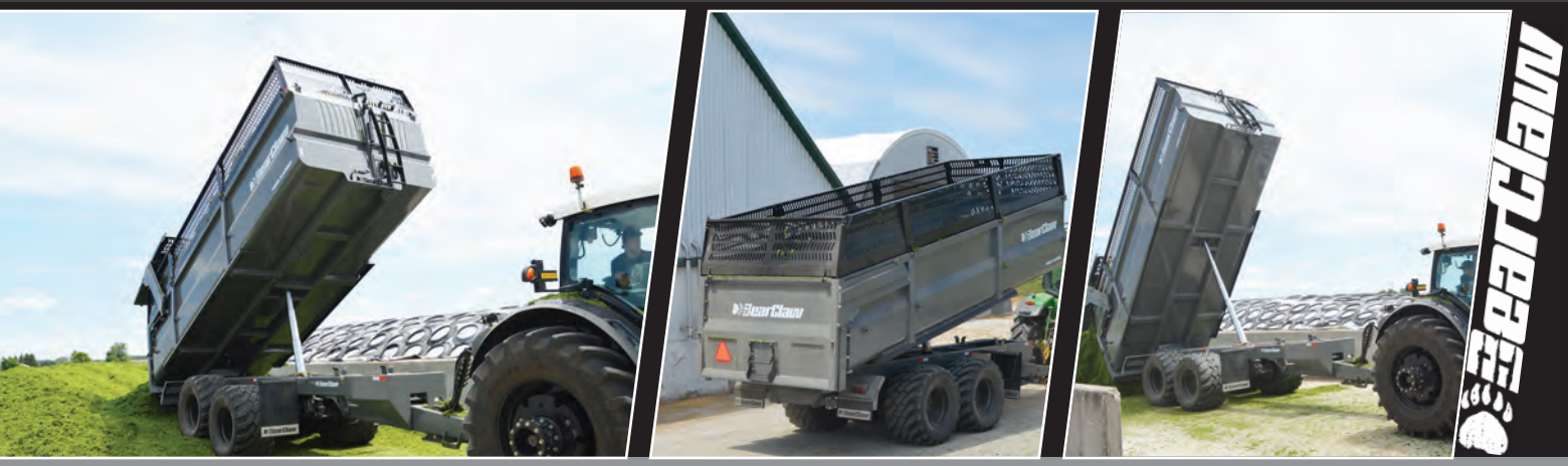
Tapered body: Helps to reduce the drag on the walls when dumping, the load ejects easier and at a lower height than straight walls.