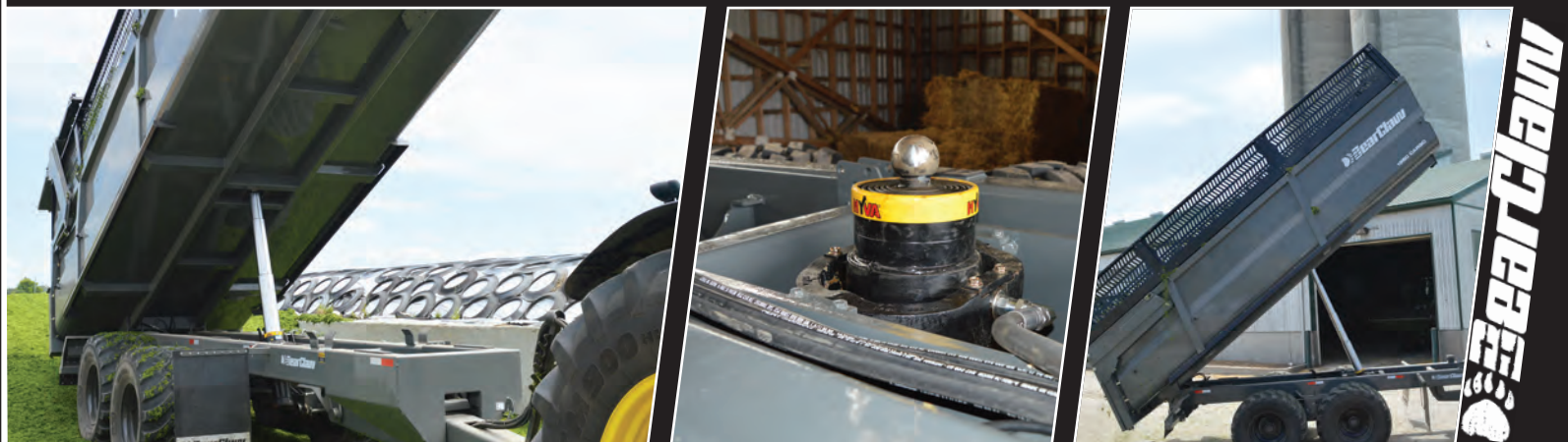
Single, Multi-stage dump cylinder: Requires less oil from the tractor, accommodating older, smaller tractors with limited oil capacity.