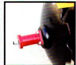
FURROW FILLER OPTION