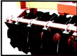
BLADE SCRAPER OPTION