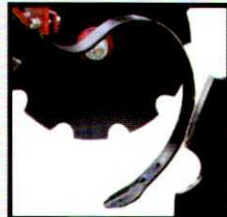
BALK BREAKER OPTION