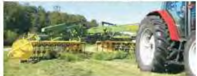
Force steered rear wheels, low centre of gravity, as well as low and narrow structure make the V-Twin 750 extremely easy to drive on the road. Changing from the transport position to the working position and vice versa is very fast. There is no need to come out of the cabin during the position change.

Thanks to the multi-tine baskets, the swath is even, and there is little risk for blockages of the harvester.