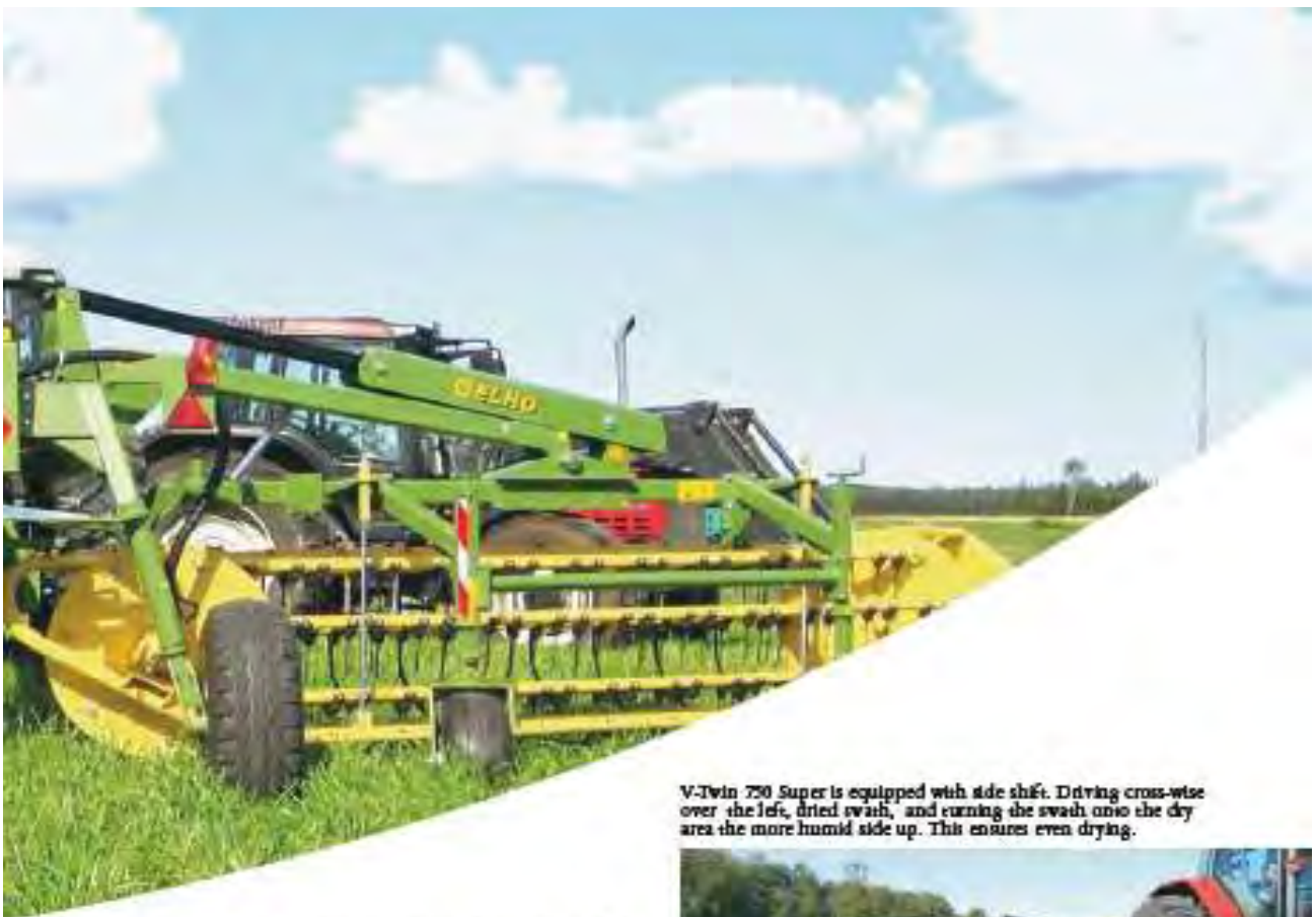
V-Twin 750 Super is equipped with side shift. Driving cross-wise over the left, dried swath, and turning the swath onto the dry area the more humid side up. This ensures even drying.

Thanks to the throwing movement of the tines of the V-Twin swather, the risk of stones in the swaths will be reduced, which can present a problem with the traditional swathers that roll on the ground. This also reduces the risk of breakage for the harvester following the swather.