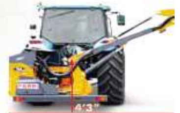
The first arm, positioned at a height of 4'3", enables the machine to easily clear guardrails.