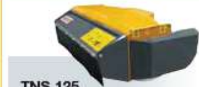
TNS 125 direct drive