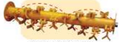
"OVERLAP" spiral rotor with two spiral rows.