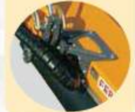
Cast forged arm brackets and fall head linkage.