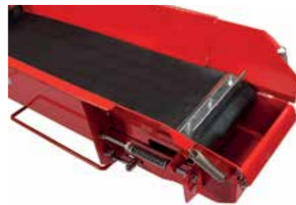
Patented cleaning outfeed conveyor as standard. The groove at the end of the outfeed conveyor separates debris from the firewood.