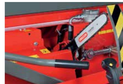
Together, the AC10 and electrical saw control ensure fast and uninterrupted operation.