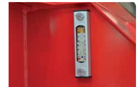
Large oil tank capacity and sight glass.

PRO SERIES WITH UNPARALLELED POWER AND EFFICIENCY