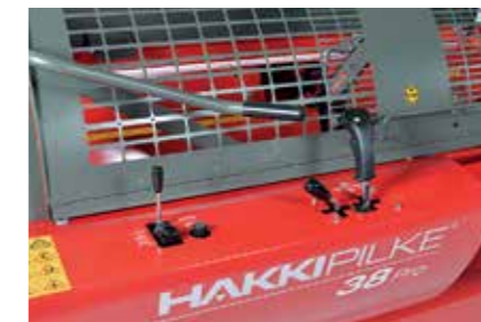
The ergonomic and easy-to-use control panel includes all the controls needed to operate the machine.