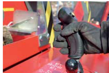
Electrical control of sawing and splitting with just two buttons.