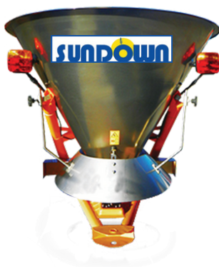
Lights kits are optional.