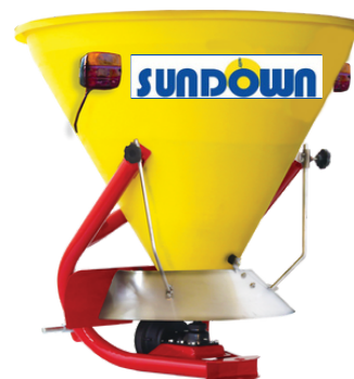
Lights kits & spread limiter are optional.